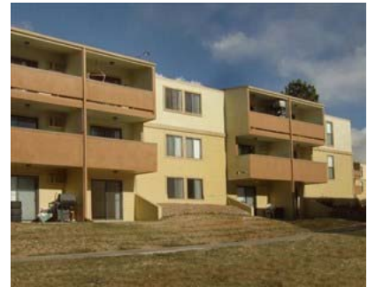
7201 Leetsdale Drive, Denver