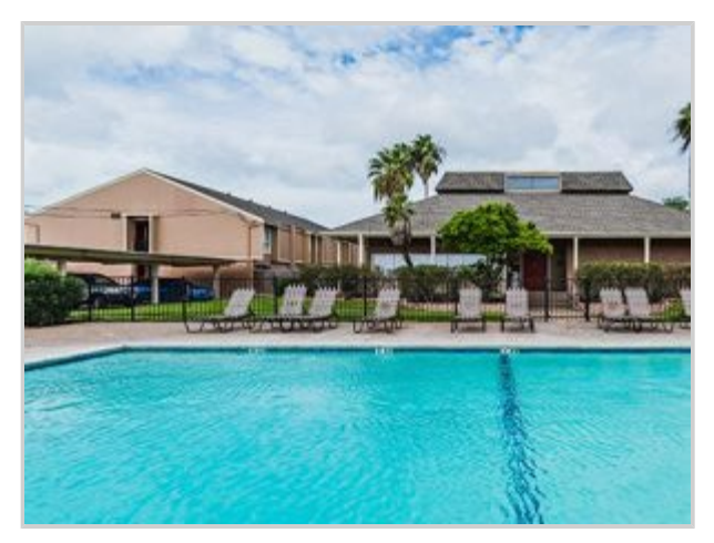
JLL Negotiates Sale of 224-Unit Apartment Community in Corpus Christi