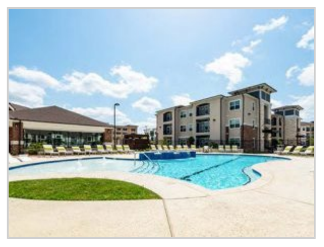
JLL Brokers Sale of 240-Unit Apartment Community in San Marcos, Texas