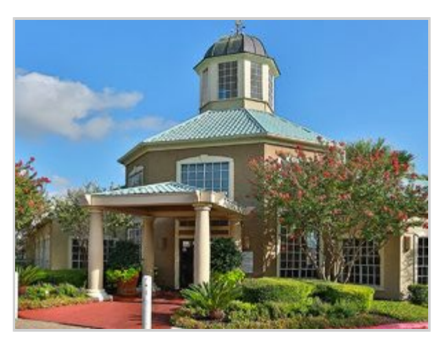
Westmount Realty Capital Acquires 300-Unit Apartment Community in San Antonio