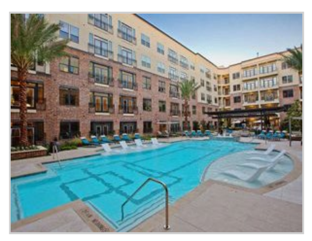
Allied Orion Acquires 312-Unit Apartment Community in Houston

HLC Equity Purchases Apartment Property in Fort Worth for $39.5M - REBusinessOnline