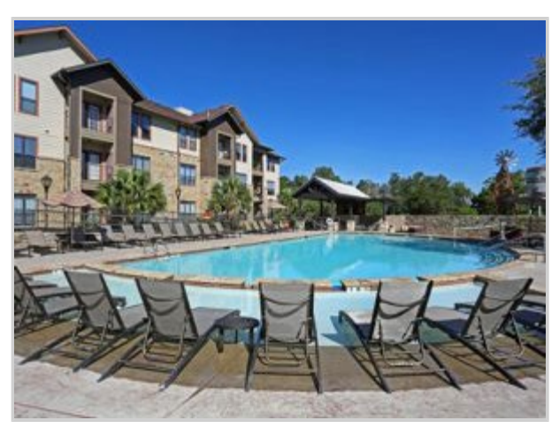
American Landmark Acquires $311M Multifamily Portfolio in Texas